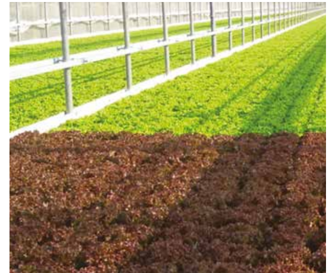
PROCESSING IN PRODUCTION SYSTEMS