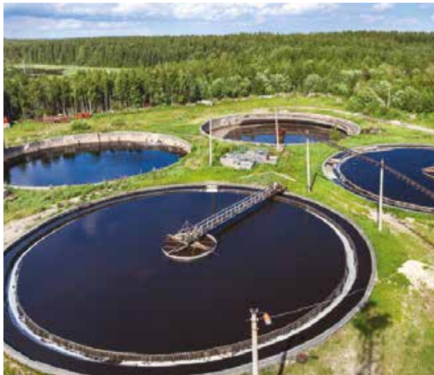
CIVIL AND INDUSTRIAL WASTEWATER TREATMENT