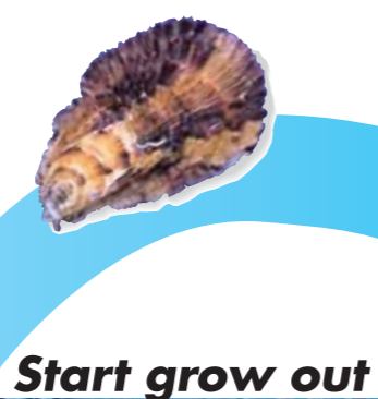
Start grow out